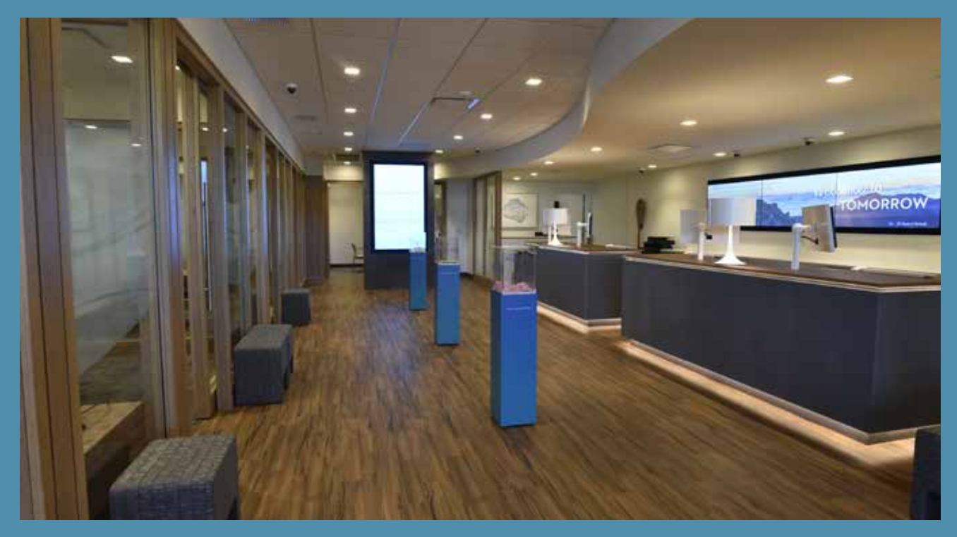
Bank of Hawaii's first "Branch of Tomorrow" at Pearl City opened for business in November 2016

Bank of Hawaii is continually looking to the future, pursuing new ideas to make banking with us the best it can be. We are excited to be introducing new technology to our customers to make their everyday transactions easier and more convenient. We also utilize technology to enable our staff to be more personally available to our customers to provide for their changing needs over their lifetime and beyond. We cherish the trust that we have built with generations of Hawaii's families and businesses through our steadfast focus on providing the highest value to our shareholders, customers, employees and community.